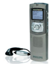
PHILIPS LFH 7675 DIGITAL VOICE TRACER