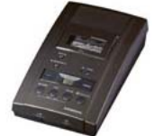
GRUNDIG DT 3110 DESK MICRO KIT