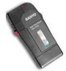
SANYO TRC 3780 MINI HANDHELD