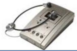
GRUNDIG ST 3211 DESK STENO KIT